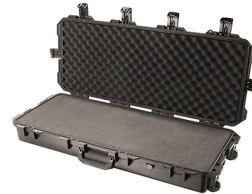
iM3100-X0001 With Foam