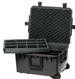
iM2750-X0002 With Padded Dividers