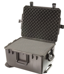
iM2750-X0001 With Foam