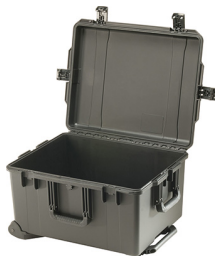
iM2750-X0000 No Foam