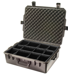
iM2700-X0002 With Padded Dividers