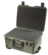
iM2620-X0001 With Foam