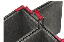
iM2600-TREK TrekPak Case Divider Kit