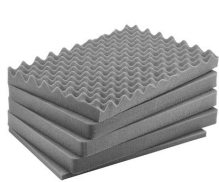
iM2600-FOAM 5 pc. Replacement Foam Set