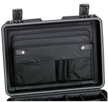
iM26XX-LIDORG Lid Organizer