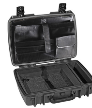
iM2370-X0003 Computer Case Deluxe