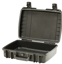
iM2370-X0000 No Foam