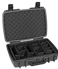
iM2370-X0002 With Padded Dividers