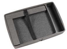
iM2370-COMPTRAY Computer Tray