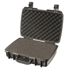
iM2370-X0001 With Foam