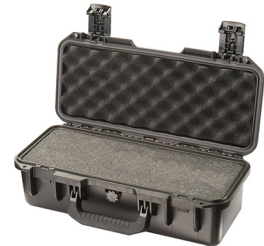
iM2306-X0001 With Foam