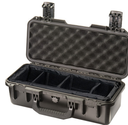
iM2306-X0002 With Padded Dividers