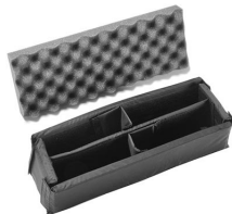
iM2306-DIV Padded Divider Set