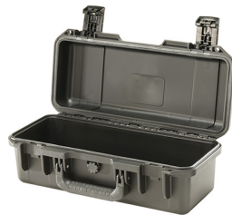
iM2306-X0000 No Foam