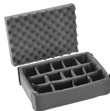
iM2200-DIV Padded Divider Set