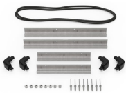
iM2200-MBEZ-B Base Bezel Kit (Metric)