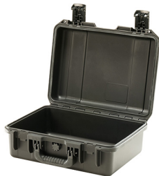
iM2200-X0000 No Foam