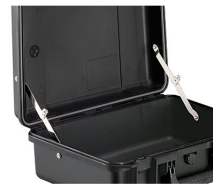
iM-LIDSTAY Lid Stay