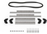
iM2200-M4-BEZEL-L Lid Bezel Kit (Metric)