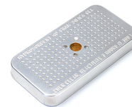
1500D Desiccant Silica Gel