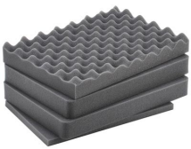
iM2200-FOAM 4 pc. Replacement Foam Set