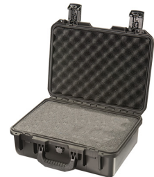
iM2200-X0001 With Foam