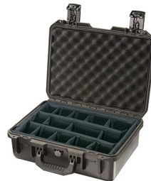
iM2200-X0002 With Padded Dividers