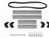
iM2100-MBEZ-B Base Bezel Kit (Metric)