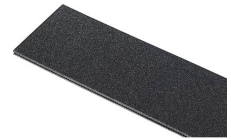
1500TPDIV Extra TrekPak Dividers