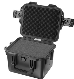
iM2075-X0001 With Foam