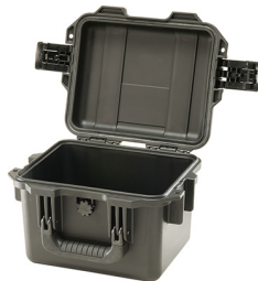
iM2075-X0000 No Foam