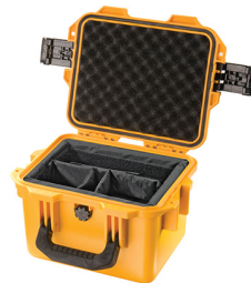
iM2075-X0002 With Padded Dividers