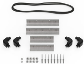
iM20XX-M4-BEZEL Base Bezel Kit (Metric)