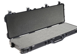
1750WF With Foam