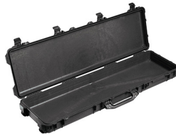
1750NF No Foam