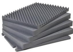
1731 5 pc. Replacement Foam Set