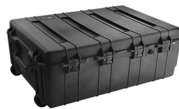
1730NF No Foam