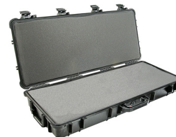
1700WF With Foam