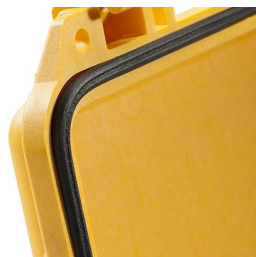
1703 Replacement O-ring