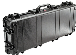
1700NF No Foam