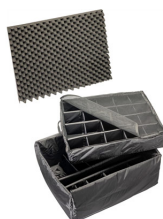
1695 Padded Divider Set