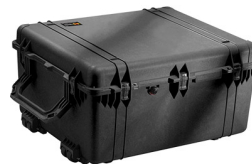
1690NF No Foam