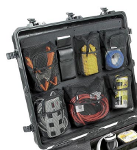
1699 Lid Organizer