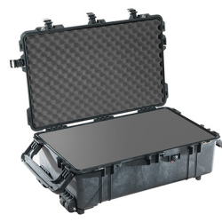
1670WF With Foam