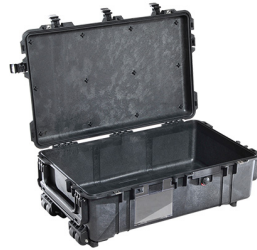
1670NF No Foam