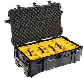
1674 With Padded Dividers