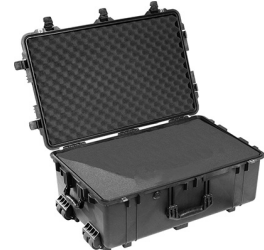
1650WF With Foam