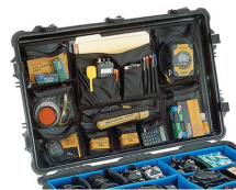
1659 Photo/Lid Organizer