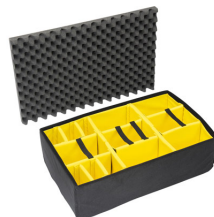
1655 Padded Divider Set