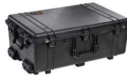
1650NF No Foam