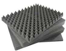
1651 4 pc. Replacement Foam Set