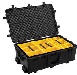
1654 With Padded Dividers