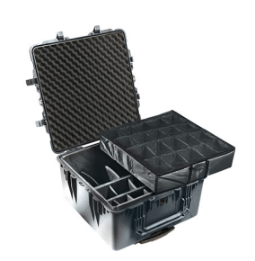
1644 With Padded Dividers