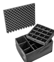
1625 Padded Divider Set