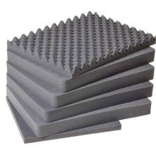
1621 6 pc. Replacement Foam Set