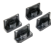
1507 Quick Mounts - set of 4