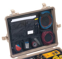
1609 Lid Organizer