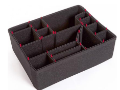
1610EUTP TrekPak Case Divider Kit