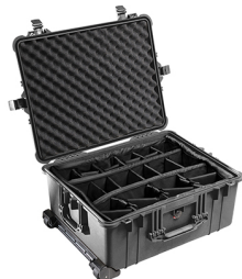
1614 With Padded Dividers