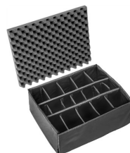
1615 Padded Divider Set