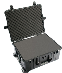
1610WF With Foam