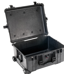
1610NF No Foam