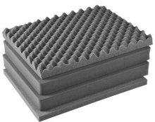
1601 4 pc. Replacement Foam Set