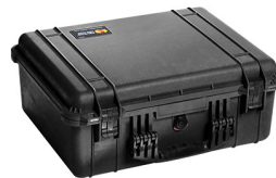
1550NF No Foam