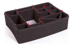
1550EUTP TrekPak Case Divider Kit