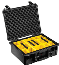
1554 With Padded Dividers