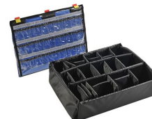
1555EMS EMS Accessory Set (Lid Organizer and Divider Set)