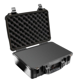
1500WF With Foam