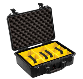
1504 With Padded Dividers