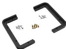
1430PF Special Application Panel Frame