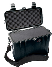
1430WF With Foam