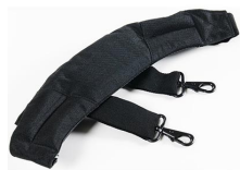
1432 Strap Kit