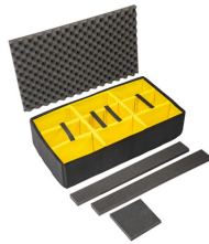
1615AirDS Padded Divider Set