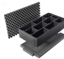
1615TPKIT TrekPak Case Divider Kit