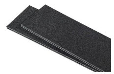
1615TPDIV Extra TrekPak Dividers