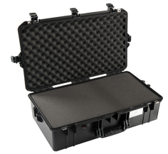
1605WF With Foam