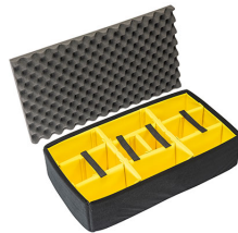
1605AirDS Padded Divider Set