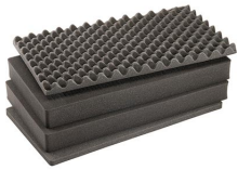
1605AirFS 4 pc. Replacement Foam Set