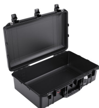
1555NF No Foam