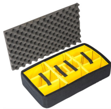
1555AirDS Padded Divider Set