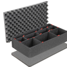
1555TPKIT TrekPak Case Divider Kit