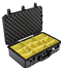
1555WD With Padded Dividers