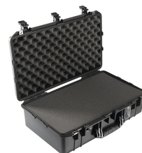
1555WF With Foam