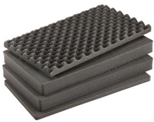
1555AirFS 4 pc. Replacement Foam Set