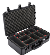
1555TP With TrekPak Divider System