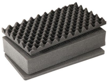
1525AirFS 3 pc. Replacement Foam Set