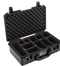
1525TP With TrekPak Divider System