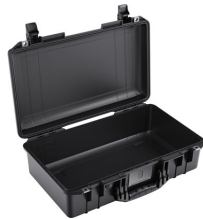
1525NF No Foam