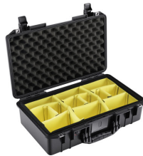
1525WD With Padded Dividers