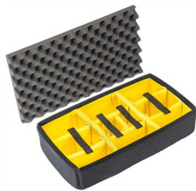
1525AirDS Padded Divider Set