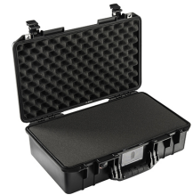
1525WF With Foam