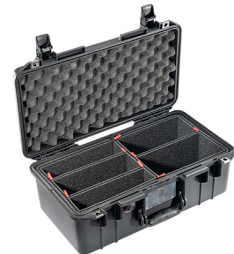
1506TP With TrekPak Divider System