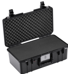
1506WF With Foam