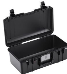
1506NF No Foam