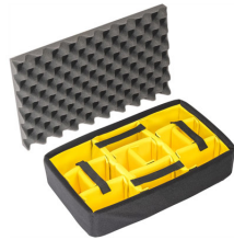
1485AirDS Padded Divider Set