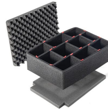
1485TPKIT TrekPak Case Divider Kit