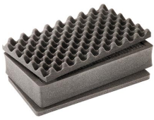
1485AirFS 3 pc. Replacement Foam Set